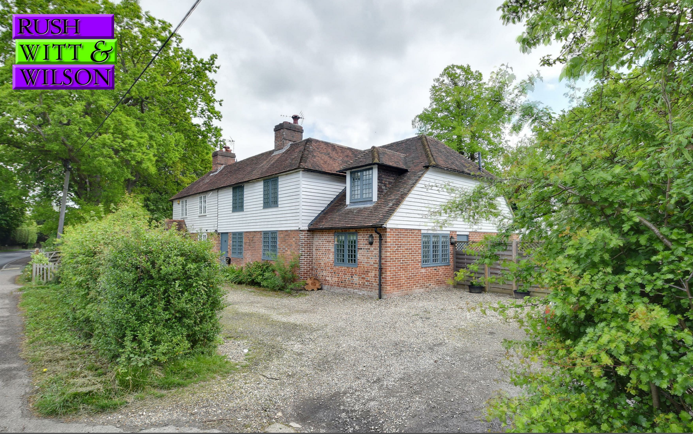
Old Elmstone Cottage, 98 North Street, Biddenden, Kent TN27 8AE Guide Price £625,000